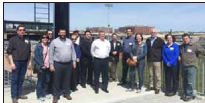
St. Paul BOMA's Superintendent's Group enjoyed a day at the ballpark complete with a tour for the April meeting!

The SPda is a public/private partnership founded by Greater Saint Paul BOMA to drive growth in downtown Saint Paul. In addition to the 2040 Visioning Project, the SPda is working to provide leadership on livability and parking issues, and long term planning for the downtown area. For more information, go to www.spdatasource.org/about/saint-paul-downtown-alliance/ .